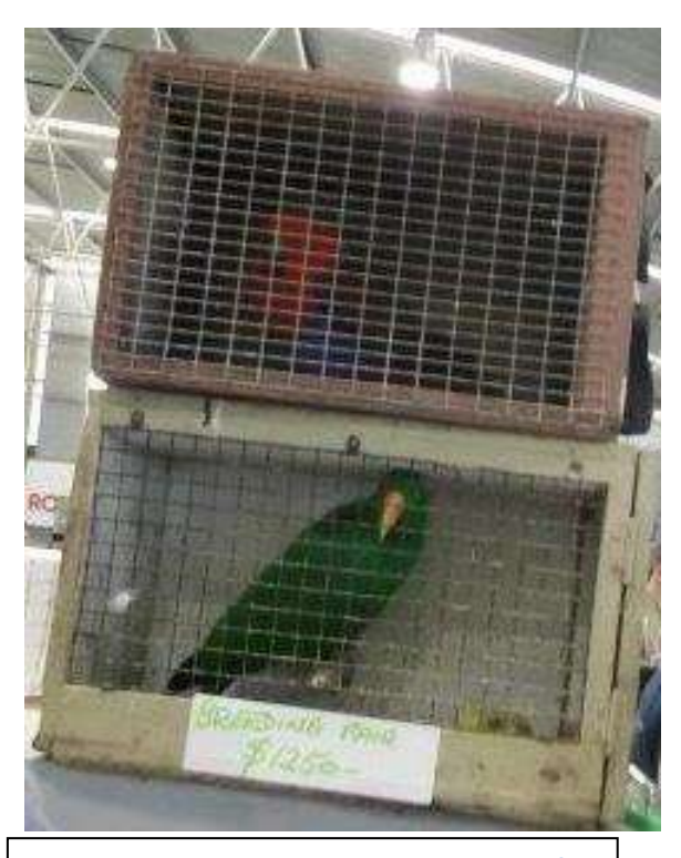
Image 1: In Melbourne, Breeding Pair of Parrots crammed in small boxes