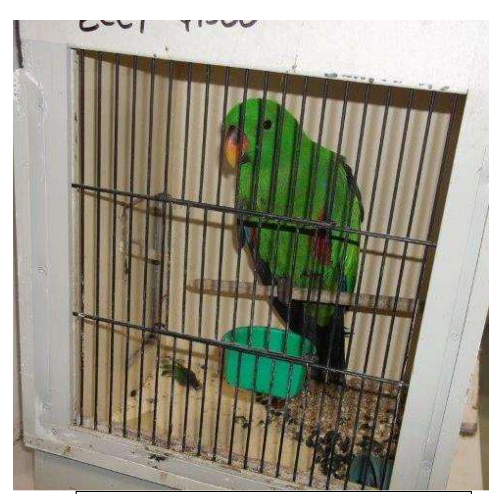
Image 2: In Melbourne, Eclectus Parrot selling at $4000 sits in small cage unable to walk and fly-seeds thrown on box floor amongst the bird's faeces